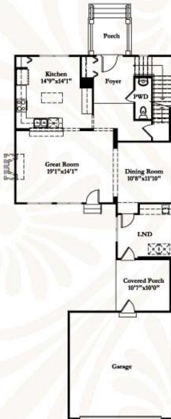
Standard First Floor