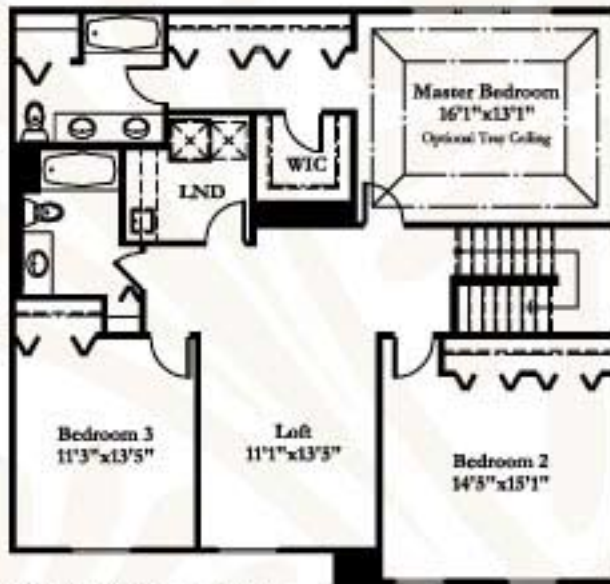
Standard Second Floor